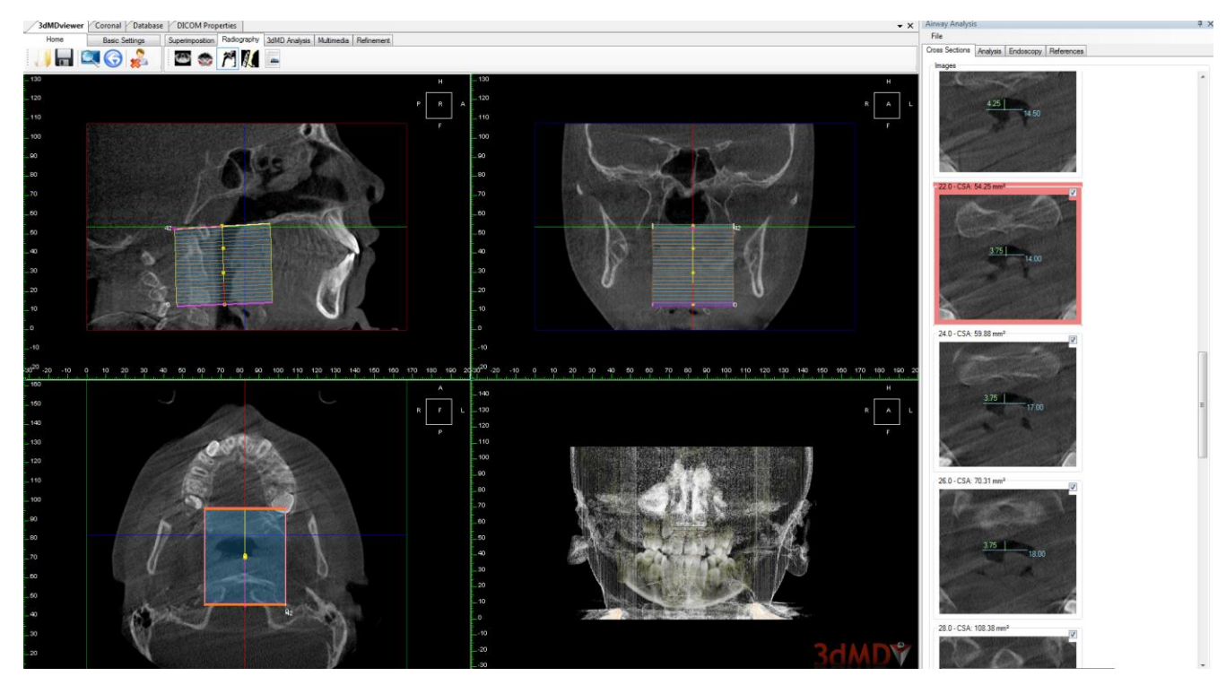
Figure 2. Landmarks in 3dMDvultus software to generate volumetric data of the airway

The volumetric CBCT airway analysis was done on anonymized scans using 3dMDvultus software (Atlanta, U.S.A). The airway superior and inferior borders were defined using the Regional Edit tool. The superior border was defined as a line connecting Sella and Posterior Nasal Spine. The inferior border was defined as a line connecting the most anterior region of the airway formed by the thyroid cartilage to the transverse arytenoid muscle at the level where the esophagus splits from the airway. Measurements of the total hypo and oropharyngeal airway volume and minimum cross sectional area were then calculated and recorded for each 2-mm distance over the entire length of the airway (Figure 2).