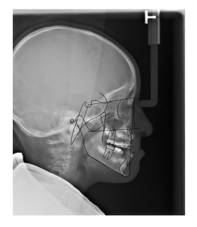
Figure 3. Lateral cephalometric tracing of a subject in the Dolphin Imaging Software